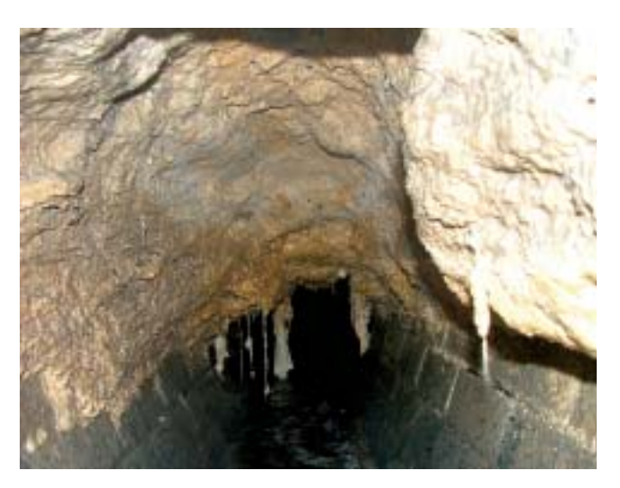
Fat beginning to block a sewer

These simple steps will not only help reduce blockages, but will also eliminate costs, negative publicity and prosecution that flooding would bring to your business. They could even reduce water usage, helping to preserve supplies and lower your bills.