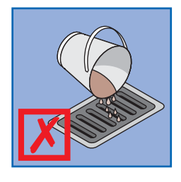
Do not pour waste oil, fat or grease down the drain.