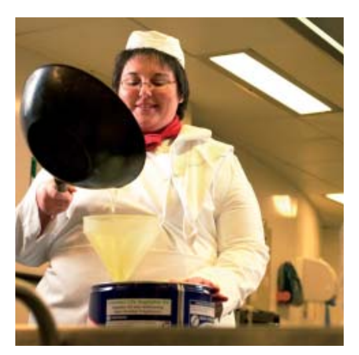
Pour waste oil into an empty drum for collection

The government supports recycling of waste cooking oil as it reduces the dependency on landfill sites and the use of fossil fuels for energy generation. Water UK supports recycling as it ensures that waste oil stays out of the drainage system.