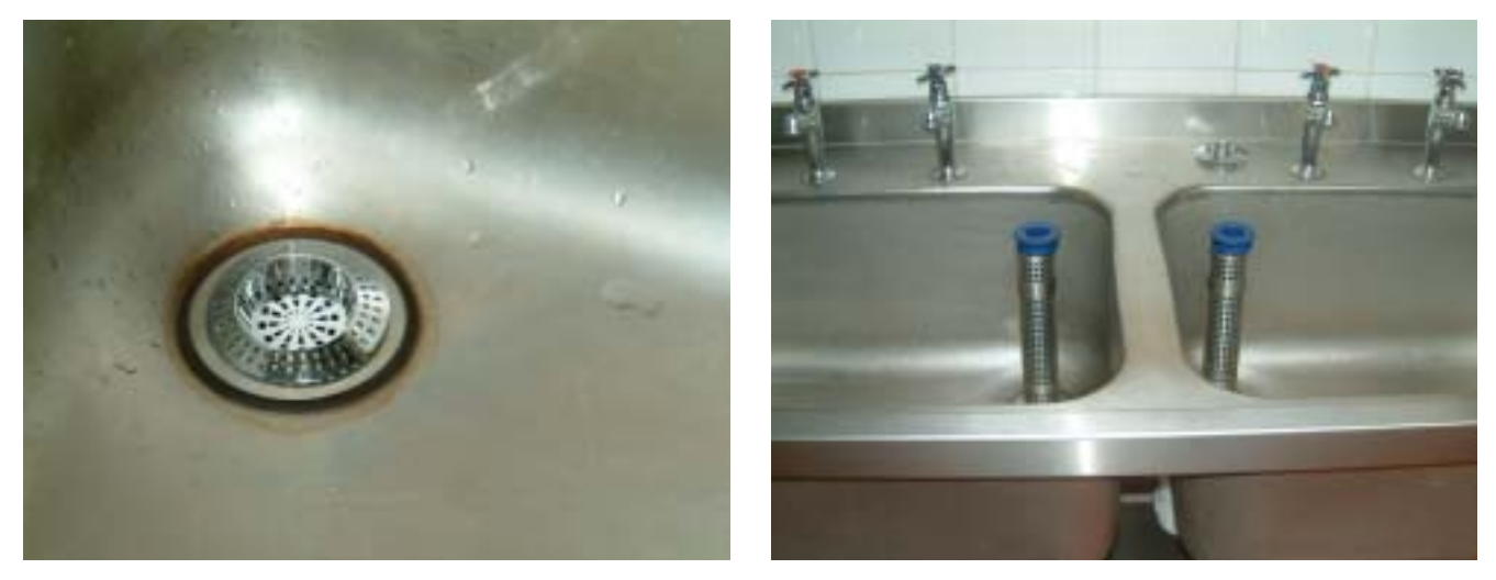
All sinks should have a strainer or a sieve for placing in the plug hole to prevent waste food from going down the drain. Waste food collected in the strainer should be placed in the rubbish bin.

Plates, pots, trays and utensils should be scraped and dry wiped with a disposable kitchen towel prior to putting them in the sink or dishwasher and the scrapings placed in the bin. All sinks should have a strainer for placing in the plug hole to prevent waste food from going down the drain. Waste food collected in the strainer should be placed in the rubbish bin ready for collection.