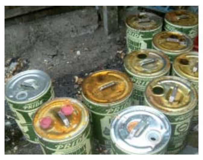
Poor storage of waste cooking oil

Waste oil comes from sources such as deep fat fryers, woks, frying pans and baking trays. Waste oil and fat should be collected in an air-tight container to prevent odours and rats. The container should be stored in a secure area, clear of all drains, to prevent spills and leakages.