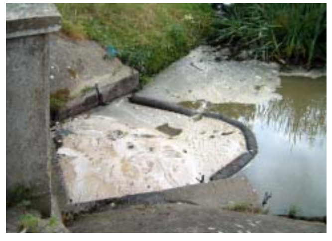
Pollution entering a stream