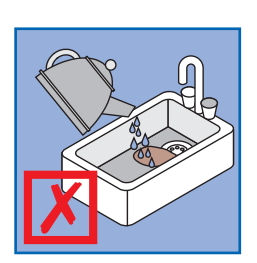
Do not pour boiling hot water down the sink to try to dissolve fat and grease. It does not work!

The above simple guidelines will significantly help to maintain free flowing water both within the drains of the premises and in the sewerage system.